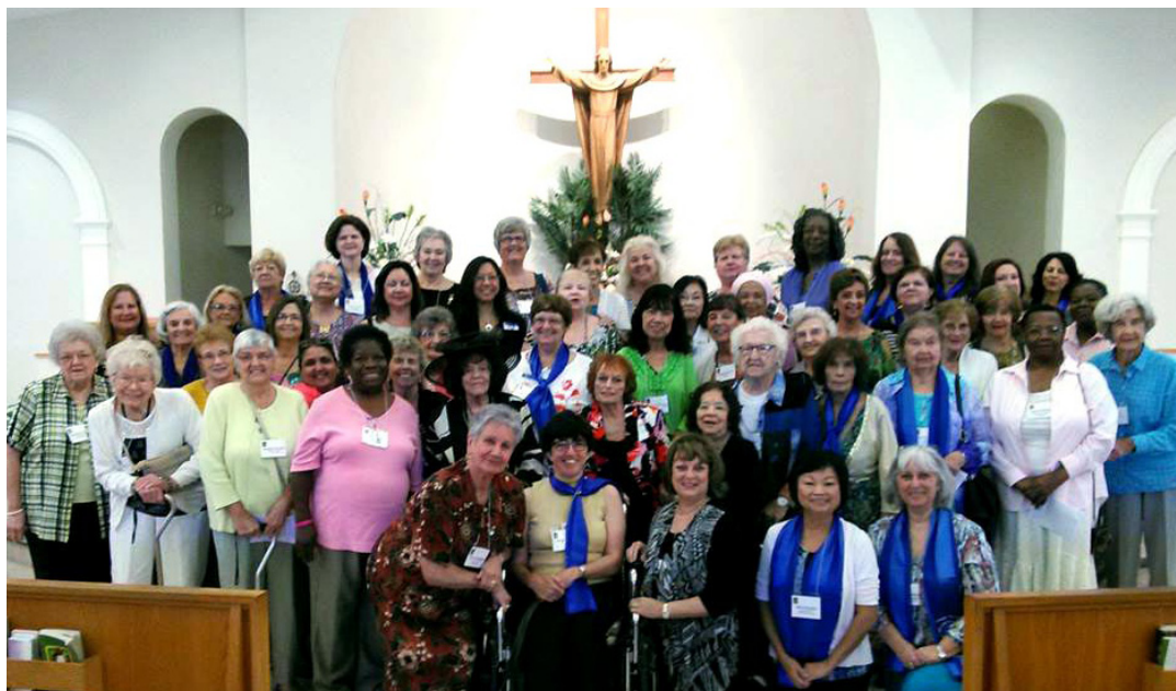
2015 Fall Conference

May Our Lady of Good Council protect us.